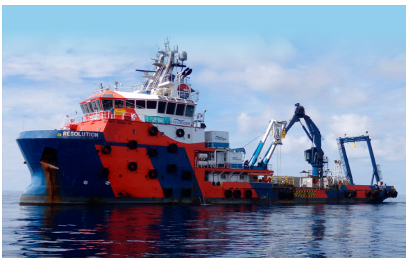
Resolution (Chartered-In) (Built in 2013)

The RSV ' Resolution ' is a DP2 ROV and diving support vessel chartered-in by Mermaid's Indonesian unit. The vessel has been specially modified for IRM duties and construction support tasks and is also capable of geophysical and geotechnical survey. This vessel is equipped with a 20-tonne main crane, 3-tonne general purpose crane, 25-tonne A-frame and accommodation for 60 personnel. The RSV 'Resolution' is Bureau Veritas/BKI classed and flies the Indonesia flag.