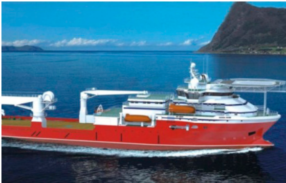
Mermaid Ausana (Under construction with delivery in 2016)

The DSCV ' Mermaid Ausana ' is a DP2 multipurpose subsea dive support and construction vessel that will be equipped with an 18-man twin bell saturation system and will have two self powered hyperbaric lifeboats. The vessel will also be equipped with diesel electric frequency controlled propulsion, highly efficient azimuth thrusters, dynamic positioning systems, offshore cranes and a large platform deck for construction duties. Based on the Norwegian MT6024 design, the vessel will have excellent characteristics for deployment worldwide. Scheduled for delivery in 2016, the DSCV 'Mermaid Ausana' will be DNV classed, fully OGP compliant and will fly the Singapore flag.