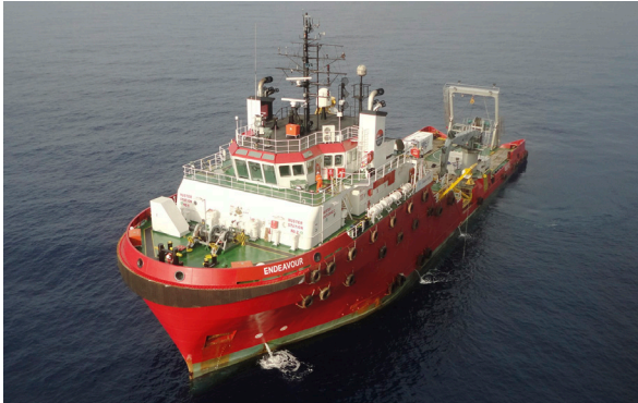
Endeavour (Chartered-In) (Built in 2008)

The RSV ' Endeavour ' is a DP2 ROV support vessel chartered-in by Mermaid's Indonesian unit. The vessel has been specially modified for Inspection, Repair and Maintenance ("IRM") duties and construction support tasks and is also capable of geophysical and geotechnical survey. This vessel is equipped with a 25-tonne main crane, 3-tonne general purpose crane, 40-tonne and 30-tonne A-frame and accommodation for 57 personnel. The RSV 'Endeavour' is Bureau Veritas/BKI classed and flies the Indonesia flag.